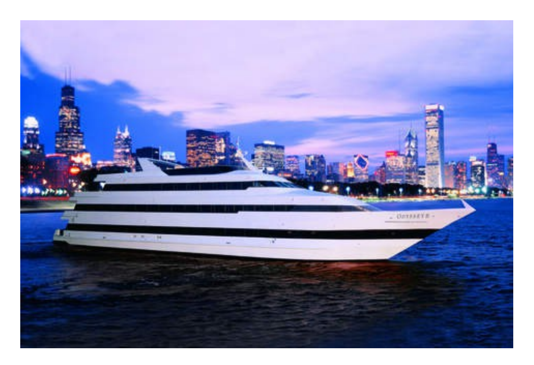
Odyssey-Lake Michigan-Chicago Skyline

2013 National Communities Council Fall Leadership Forum Enjoy a Chicago, Lake Michigan - Odyssey Dinner Cruise - US Destination